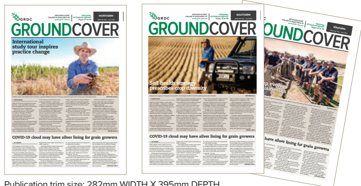
Publication trim size: 282mm WIDTH X 395mm DEPTH

8 MODULE WIDE / DOUBLE PAGE SPREAD T88 544 X 380